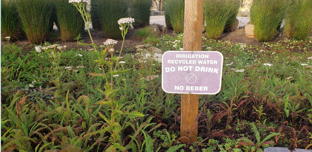
MCWD Imjin Office landscaping