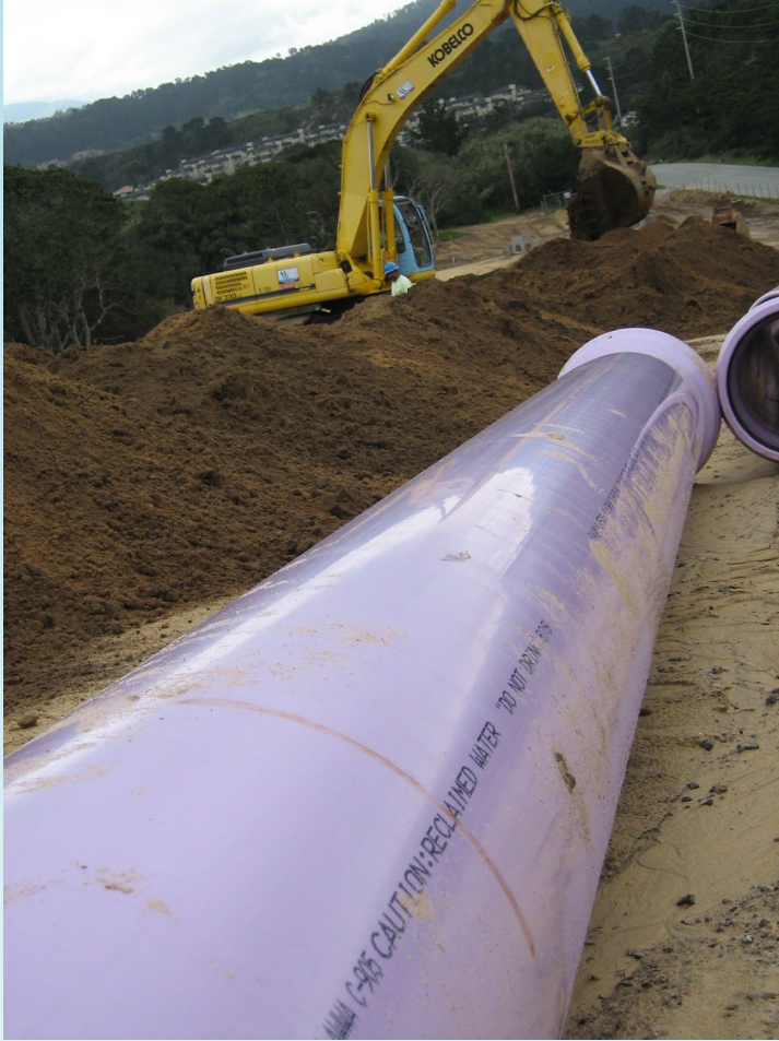
MCWD Recycled Water Transmission Line Construction